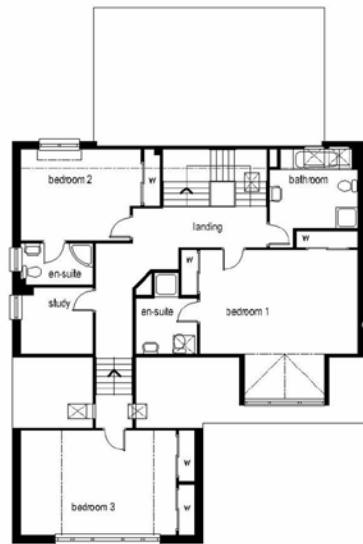
first floor plan.