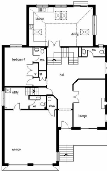
ground floor plan.